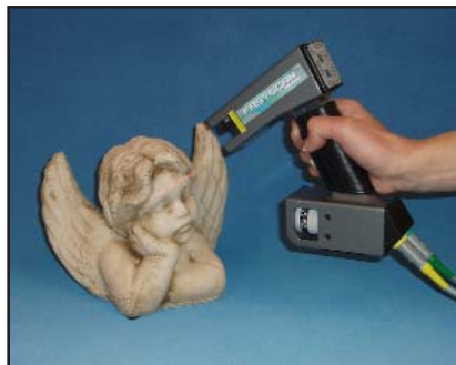
COBRA scanning wand