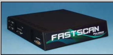
FastSCAN systems electronics unit (SEU)