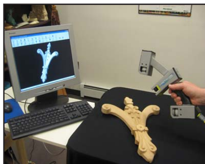
SCORPION scanning wand