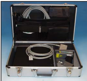
Entire COBRA system fits in compact carrying case

Allows for measurements in main display window to be calculated in millimeters or inches.